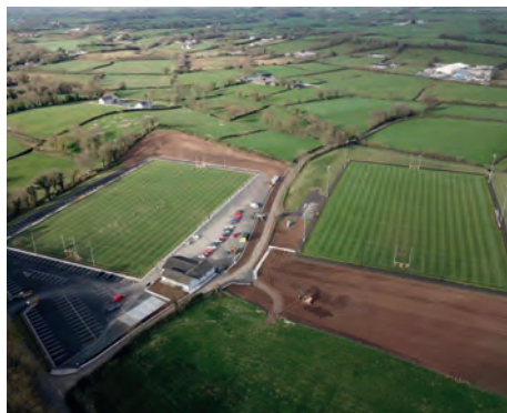
New pitch completed 2

was marked with the opening of a Gym for use by both the footballers and camogs alike. Phase Five of our Development is well in hand. All made possible by the assurance of voluntary labour and general volunteerism. The establishment and continued presence of Club Portglenone has proved to be the