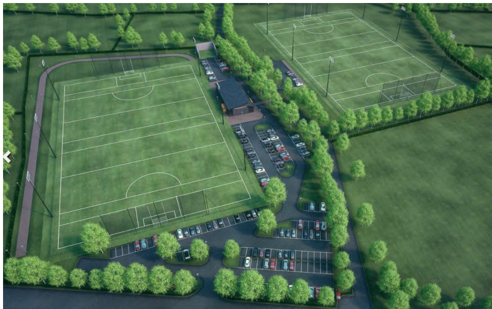
3D plan of pitch before development

backbone and driving force of all future development. We are committed to investing for future generations, determined to improve our facilities, drawing on the skills and drive of our members and enthusiastic to set and achieve the necessary fundraising targets.