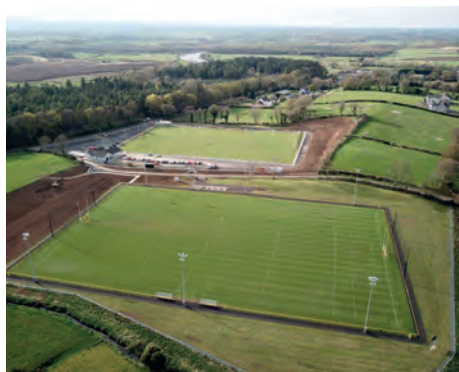
New pitch completed