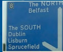
Belfast Daily Shuttle