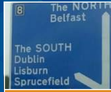
Belfast Daily Shuttle