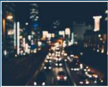
Over Night Dispatch