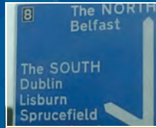
Belfast Daily Shuttle