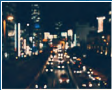
Over Night Dispatch